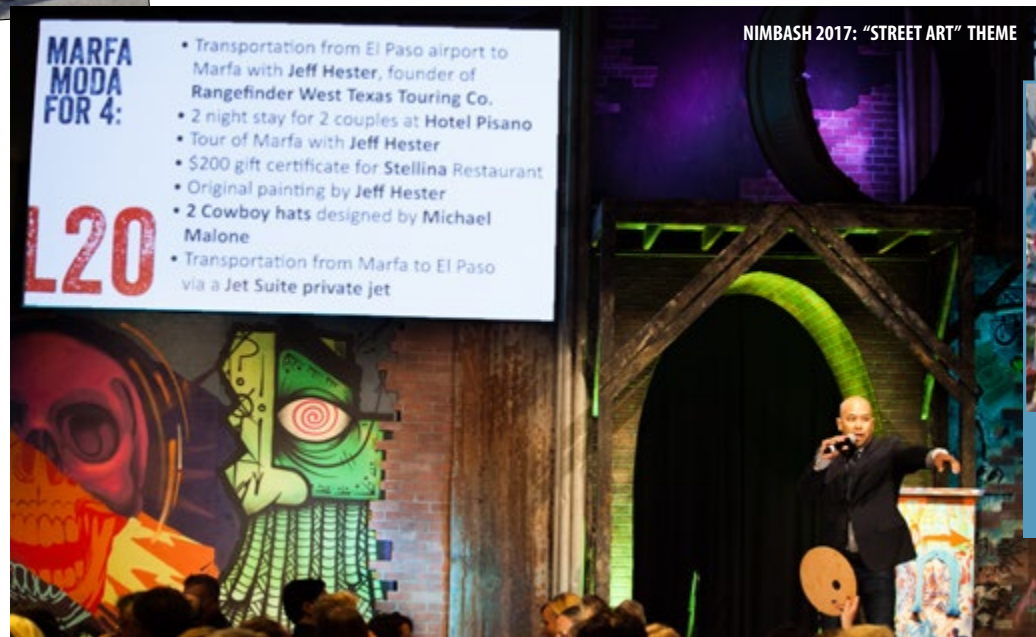
NIMBASH 2017: “STREET ART” THEME