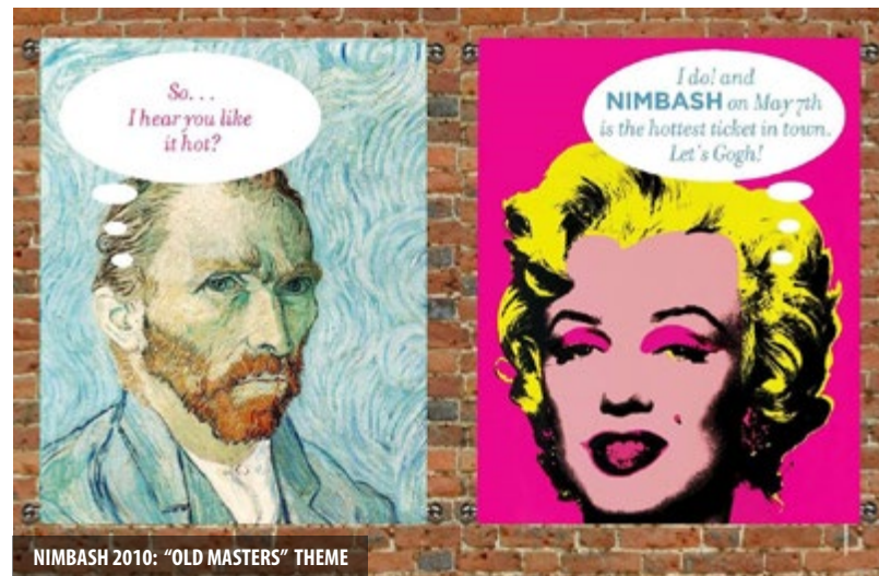
NIMBASH 2010: "OLD MASTERS" THEME