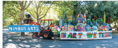
2017 Calistoga 4 th of July Parade

The always-popular Nimbus Arts summer camps are filling up fast! Designed for children between 6 and 14, our one-of-a-kind camps are created to inspire the