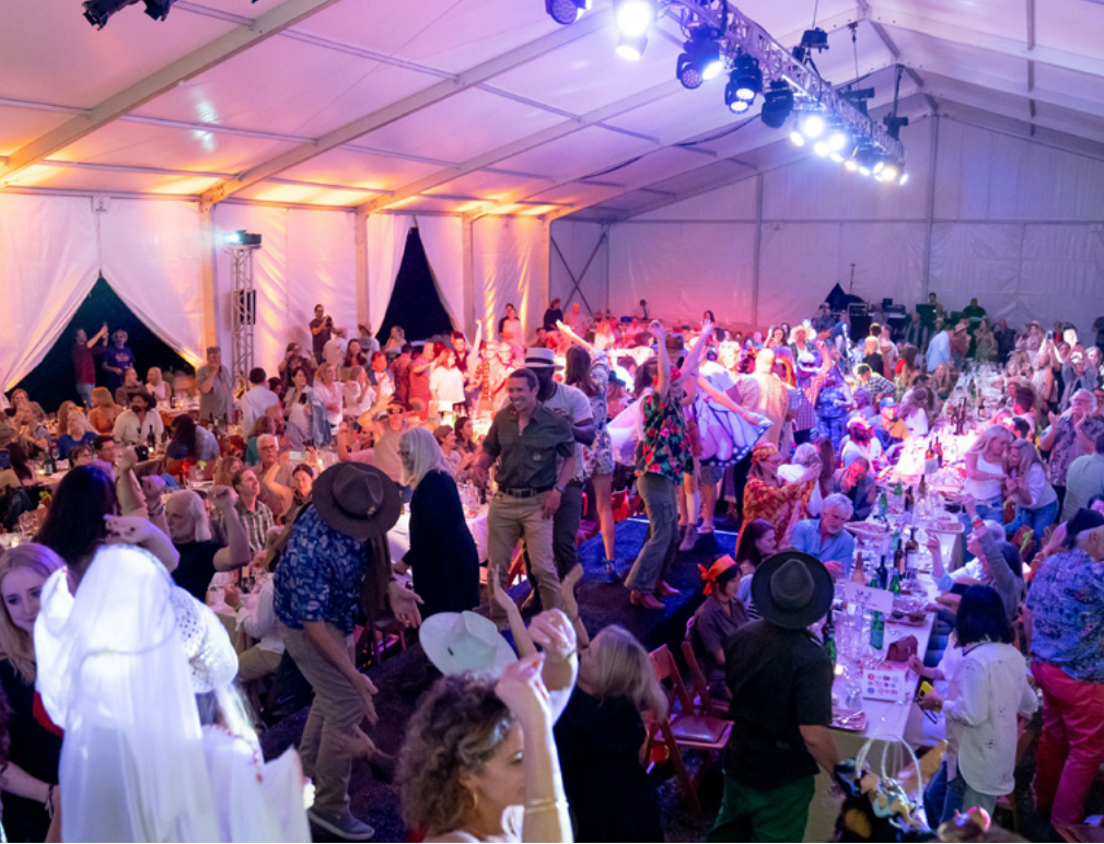
NIMBASH 2023: "CAMP NIMBASH" THEME