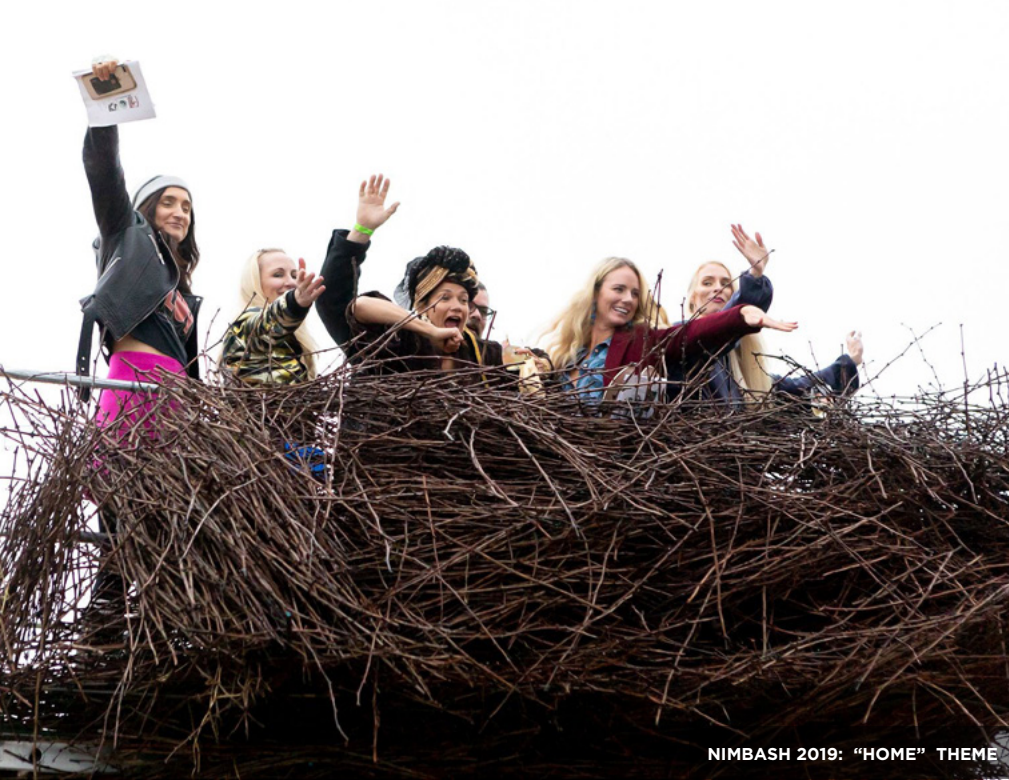
NIMBASH 2019: "HOME" THEME