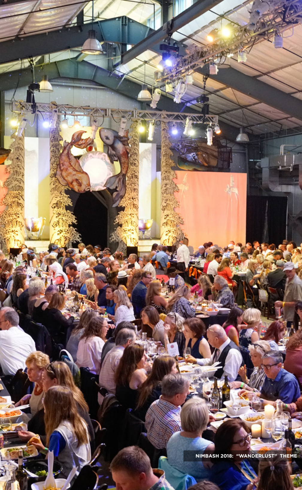
NIMBASH 2018: "WANDERLUST" THEME