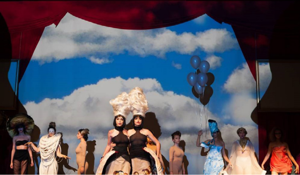
NIMBASH 2019: "HOME" THEME